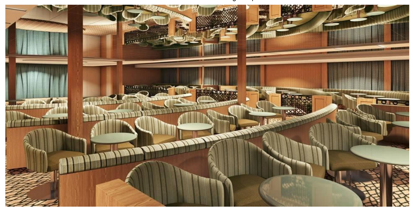
Gierlings Velpor enters the Cruise Lines segment

After its re-entry in the Public Transport segment four years ago, Gierlings Velpor has successively won new projects in Bus and Rail sub-segments highlighting the company's recent appointment as the supplier for the new Lisbon Metro projects. Latter this year, a new stage has been reached with the penetration of the Cruise Lines segment. Complying with all requirements and standards required in this sector, a polyester "flame retardant" velvet provided by Gierlings Velpor, adorns today, chairs and sofas of the Cruise Funchal.